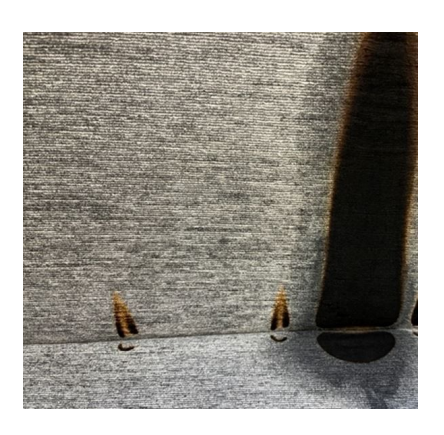
Test of: Combination of upholstered material tested designated: Duke