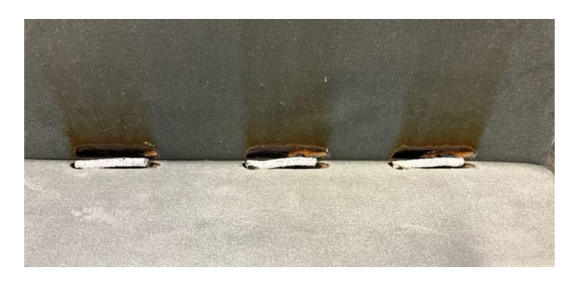
Test of: Combination of upholstered material tested designated: Avalon, 004