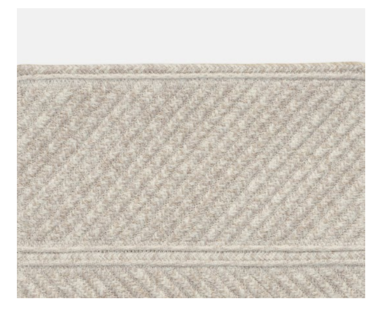
Corde Chevron Stitching 95% pure New Zealand wool, 5% cotton 5 colours 9mm (½") high 2600g/m² (8.5 oz/sq ft) 300cm × 400cm (118" x 157 ½")