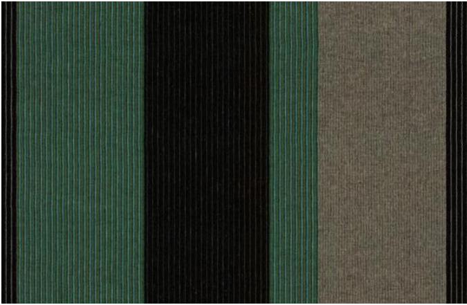
Fil-a-Fil Design: Inga Sempé

Type: Curtain Composition: 64% linen, 29% lyocell, 7% recycled silk Yarn type: Filament Binding: Twill Width: Approx. 300 cm, 118 inches Weight: Approx. 400g/m, 13 oz/y Repeat: Approx. 140 cm, 55 inches V, 0 cm, 0 inches H