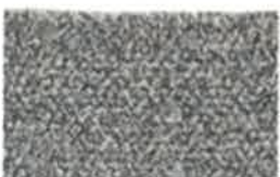
Miori Outdoor 0741 blue clay