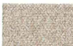
Miori Outdoor 0211 limestone