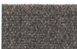
Miori Outdoor 0541 red earth