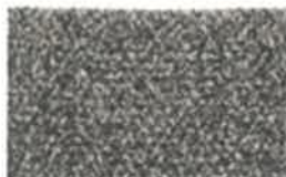
Miori Outdoor 0171 volcanic soil