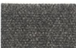
Miori Outdoor 0381 black soil