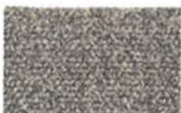
Miori Outdoor 0261 warm clay