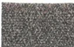
Miori Outdoor 0181 river pebbles