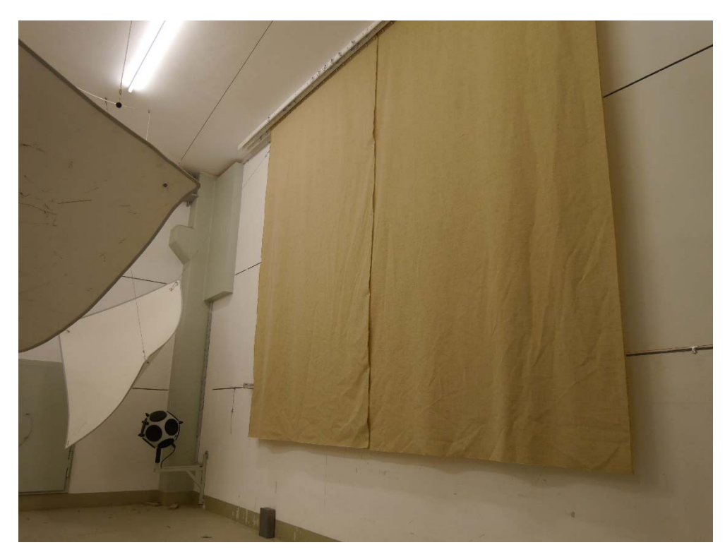
Figure B.2. Test object in the reverberation room: diagonal view.