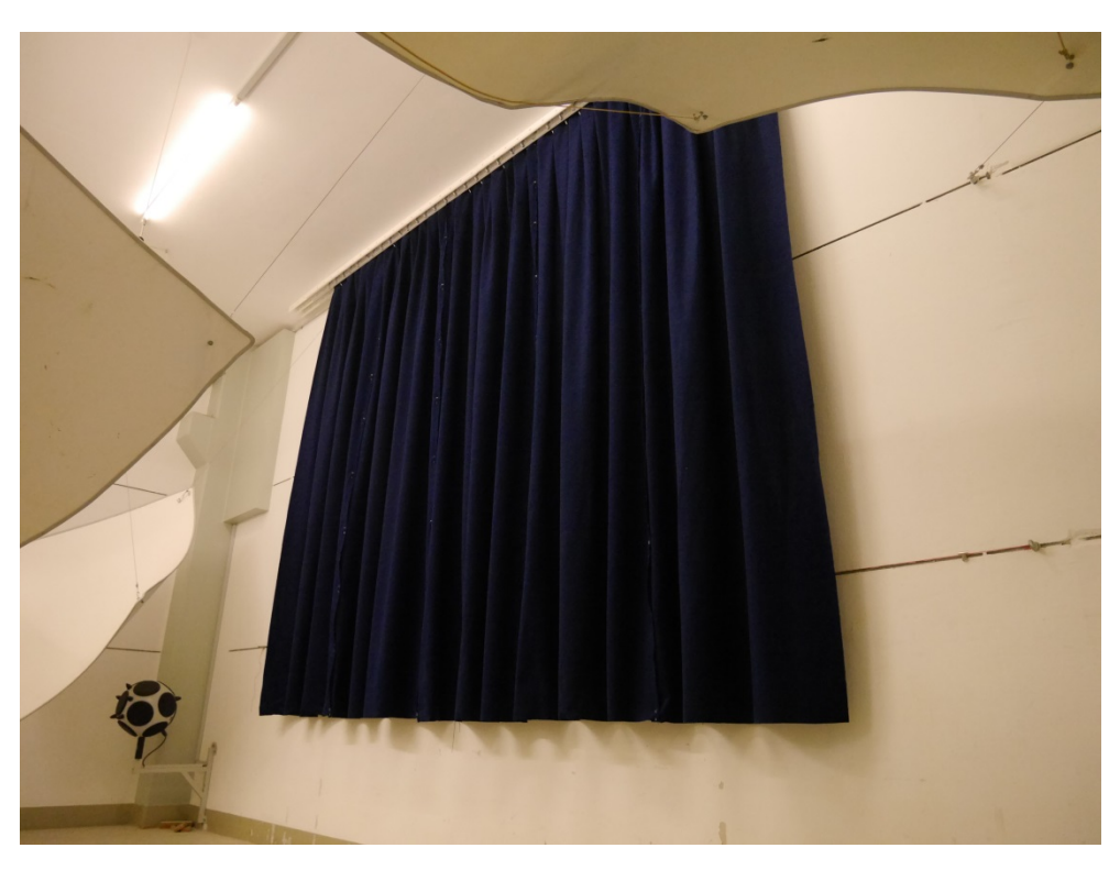
Figure B.4. Folded arrangement: test object mounted in the reverberation room, diagonal view.