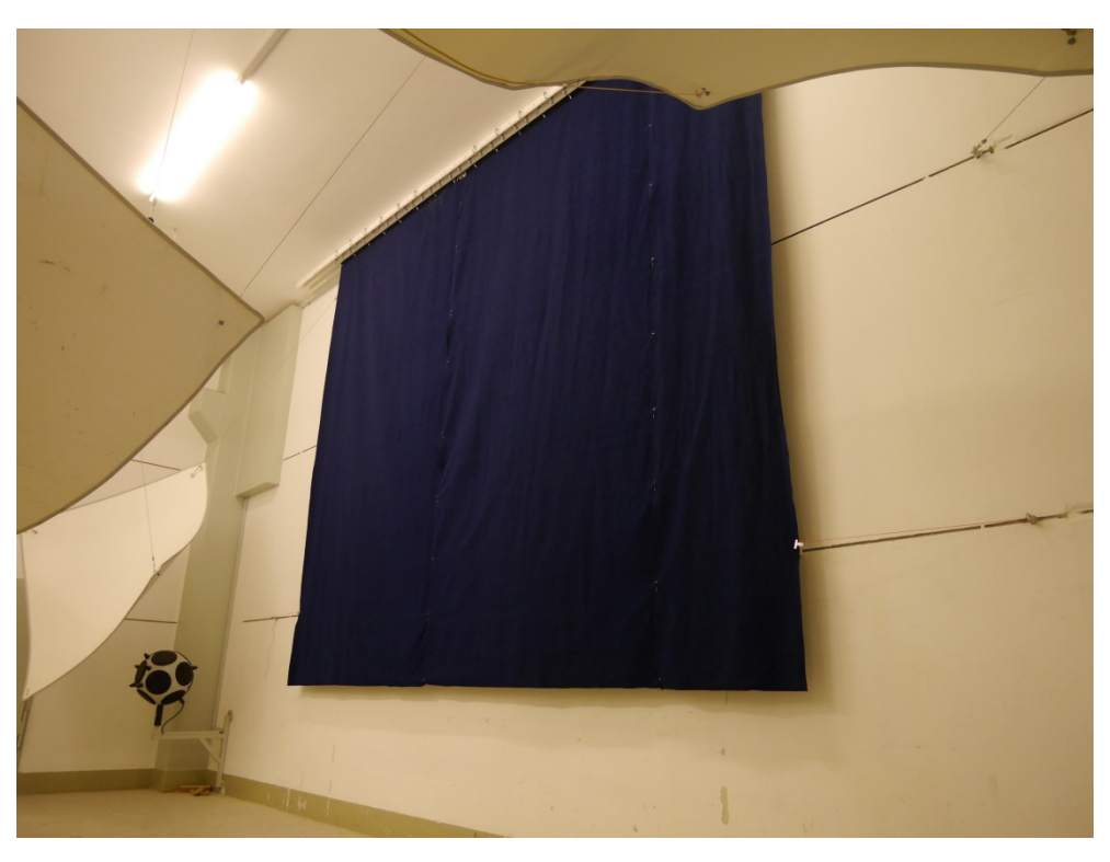
Figure B.2. Flat arrangement: test object mounted in the reverberation room, diagonal view.