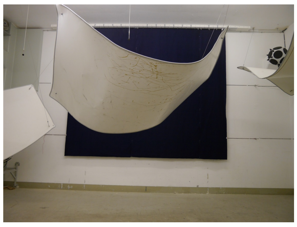
Fabric Type Still, Manufacturer Kvadrat A/S