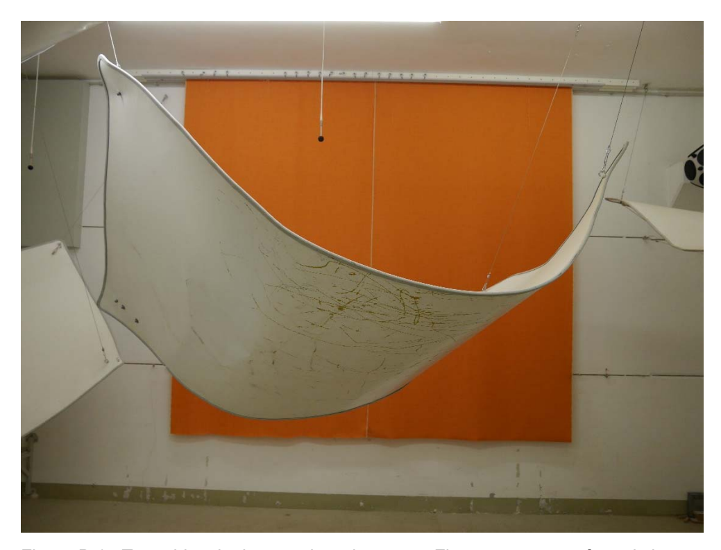
Figure B.1. Test object in the reverberation room: Flat arrangement, frontal view.