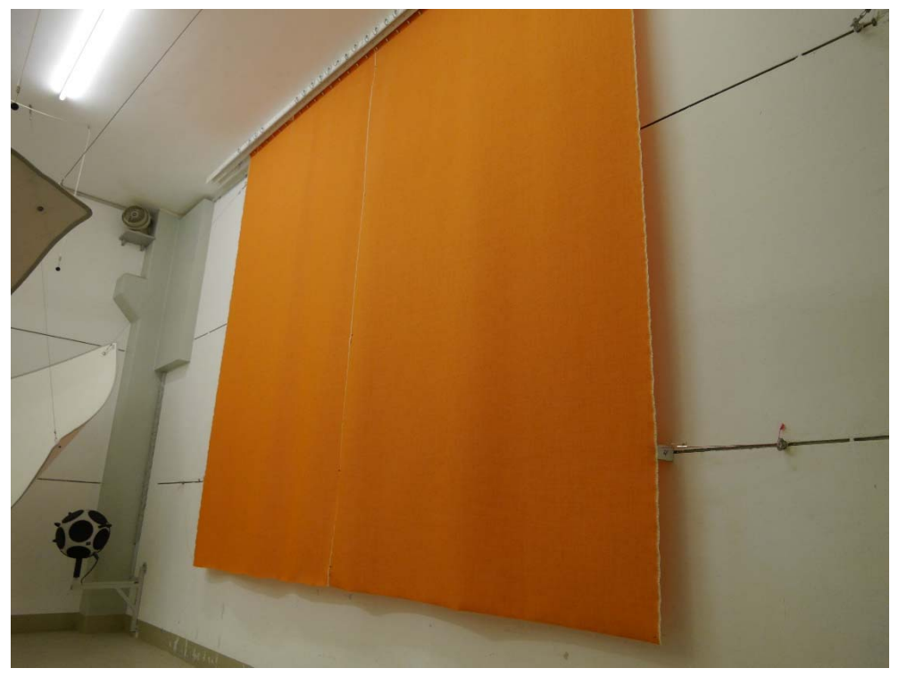
Figure B.2. Test object in the reverberation room: Flat arrangement, diagonal view.