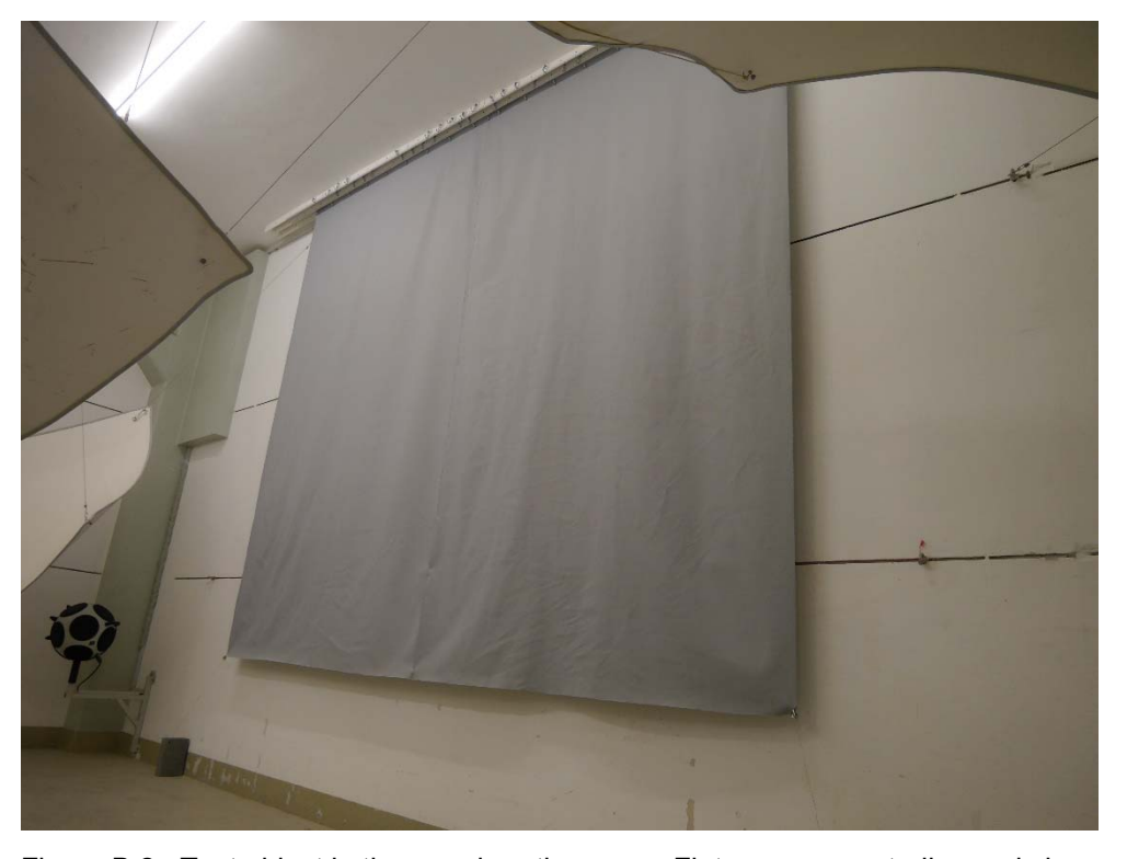
Figure B.2. Test object in the reverberation room: Flat arrangement, diagonal view.