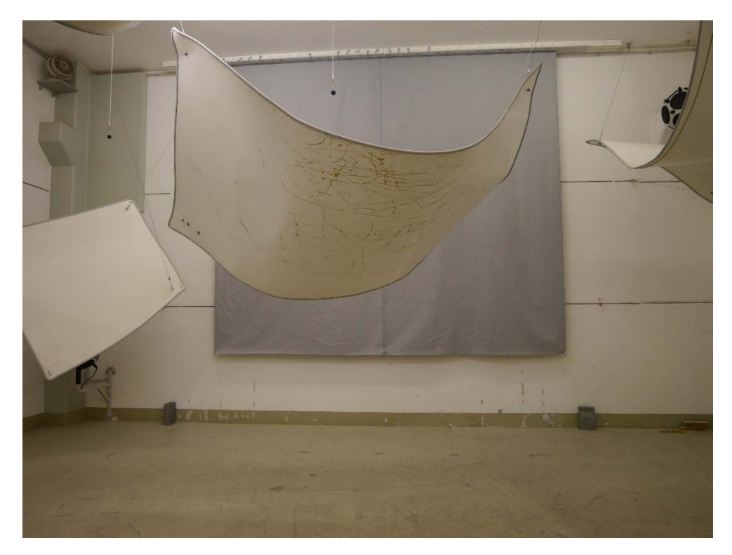
Figure B.1. Test object in the reverberation room: Flat arrangement, frontal view.