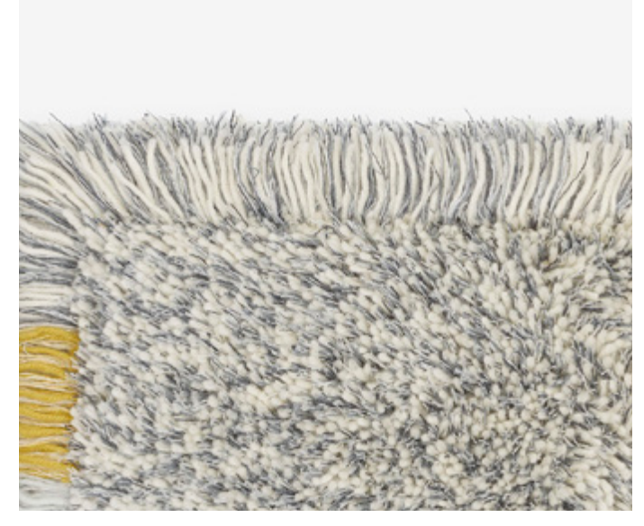
Silhouette Hand tufted 100% pure New Zealand wool Custom sizes available