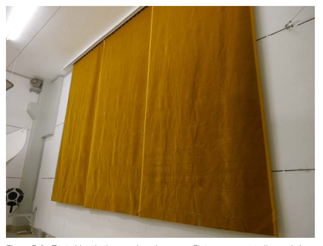
Figure B.2. Test object in the reverberation room: Flat arrangement, diagonal view.