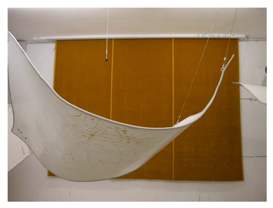
Figure B.1. Test object in the reverberation room: Flat arrangement, frontal view.