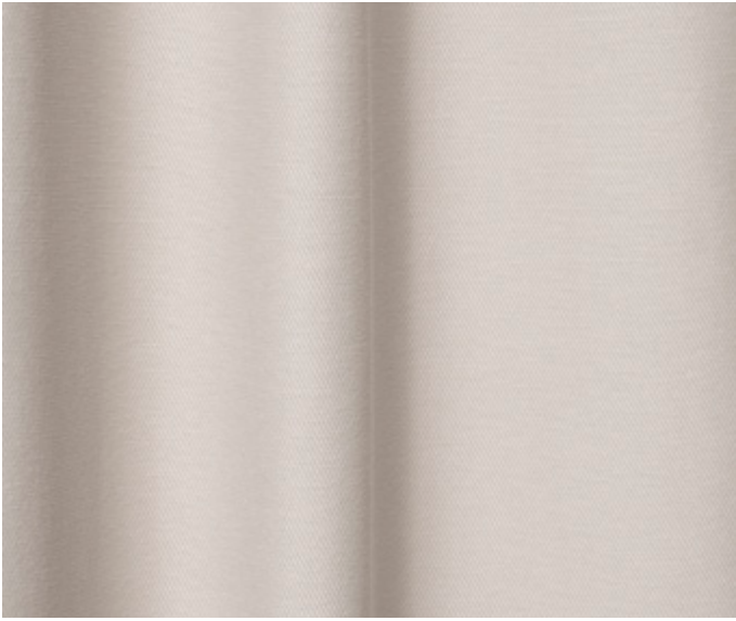
Lake 100% polyester FR 11 colourways 300cm wide